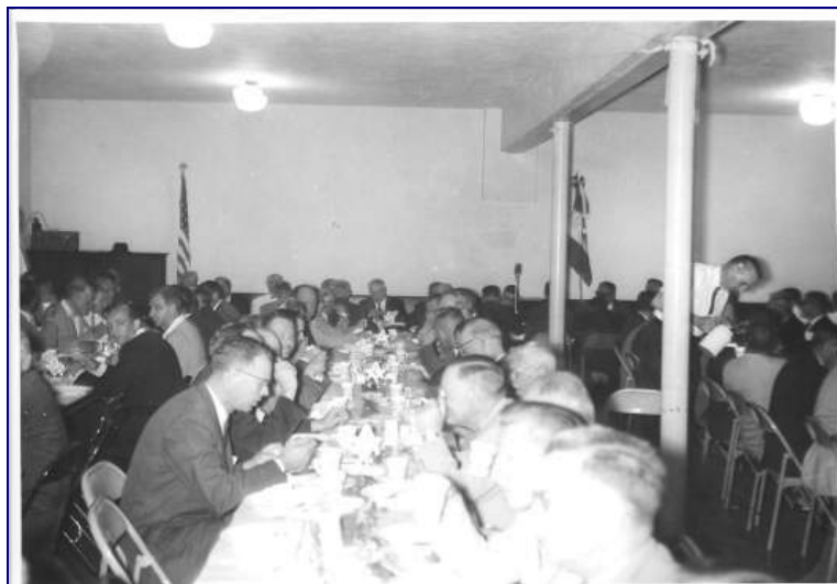
Figure 24 Brothers breaking bread together