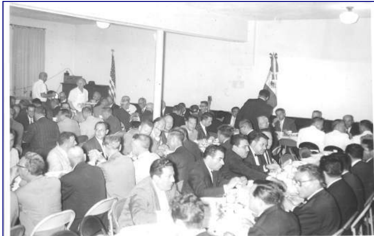
Figure 23 Banquet celebrating International Masonic Brotherhood