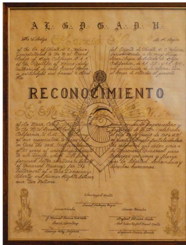
Figure 32 Testimonial Marking 25 Years of Visits

Again, continuing the longstanding tradition of fraternal ties with our brothers in Baja California, the Lodge visited Acacia Lodge #8 in Tecate in June of 1986 and marked twenty-five years of fraternal visits between the two lodges. The brethren of Acacia Lodge presented a program to honor the Saints John, and marked the occasion with a testimonial.