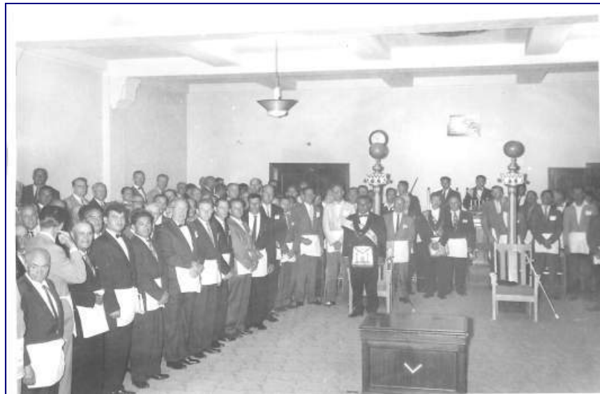
Figure 26 Acacia Lodge #8 in the South and West at La Mesa Lodge #407