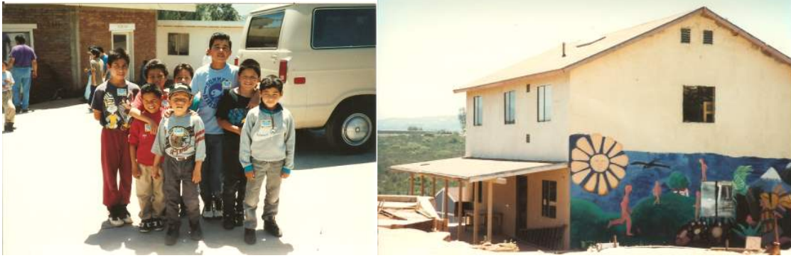
Figure 31 Our Friends in Tecate and their home

Again, continuing the longstanding tradition of fraternal ties with our brothers in Baja California, the Lodge visited Acacia Lodge #8 in Tecate in June of 1986 and marked twenty-five years of fraternal visits between the two lodges. The brethren of Acacia Lodge presented a program to honor the Saints John, and marked the occasion with a testimonial.