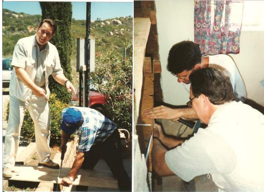
Figure 30 La Mesa Brothers working at a Tecate Orphanage

The Brothers over the years have participated in several visits to orphanages in the Tecate area to help the less fortunate. These visits have served to cement the bonds of brotherly love, relief and truth that hold all Masons together on the level.