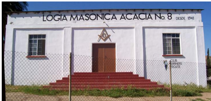
Figure 29 Acacia Lodge #8, Tecate, Baja California

Over the years, the La Mesa Lodge maintained a program of annual visitations to our Brothers in Tijuana and Baja California. In 1969, the officers and many members of the La Mesa Lodge visited Acacia Lodge, and in the first occasion of