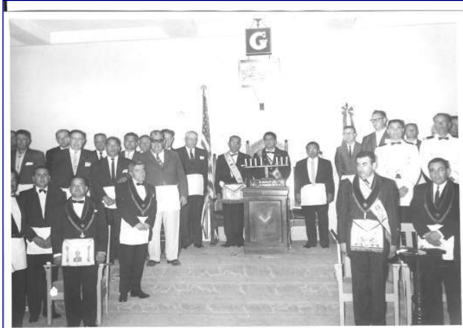
Figure 25 Acacia Lodge #8 in the East at La Mesa Lodge #407